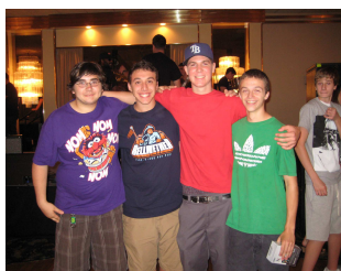
2011 Bands Battling Autism winners, Last Great Hero

Stay tuned for future events hosted by the Youth Leadership Council!