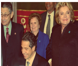
Governor Cuomo signing the New York autism insurance reform legislation

New York is now the 29th state to end autism insurance discrimination. Effective November 1, 2012, state-regulated health plans are required to cover the screening, diagnosis, and treatment of autism. The landmark legislation, one of the strongest bills in the nation, imposes no age caps and no visit caps that apply solely to ASD, and provides for applied behavior analysis (ABA) thera-