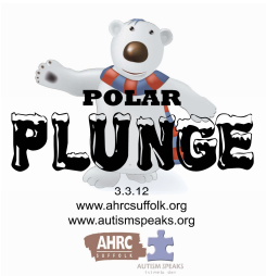
Proceeds of the 2012 Polar Bear Plunge will benefit Autism Speaks and AHRC Suffolk

( www.walknowforautismspeaks.org/longisland ) for more information on how to get involved as it becomes available.