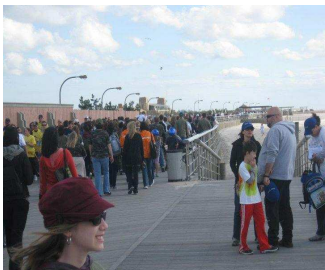
Over 30,000 individuals arrived at Jones Beach State Park to show Autism Speaks their support!

Wantagh, NY — The 12th Annual Long Island Walk Now for Autism Speaks took place on a beautiful unseasonably warm fall day on Sunday, October 2nd at Jones Beach State Park.